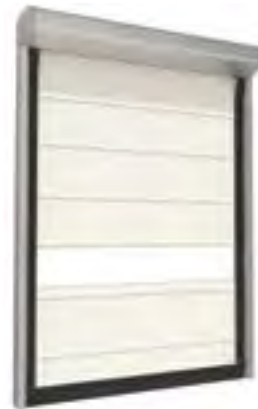
MAVICLEAN® , the door for clean rooms.