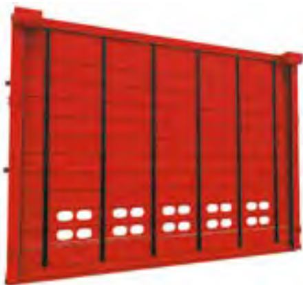
MAVIMAX® , the door in XXL format.