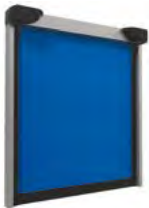
MAVIONE® , the right door for interior environments.