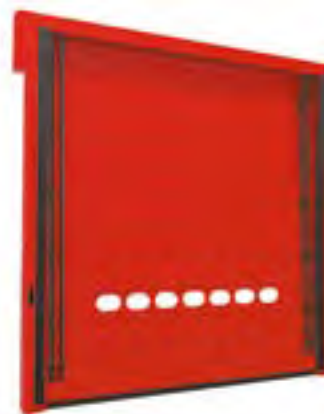
MAVIPASS® , the door dedicated to outside environments.